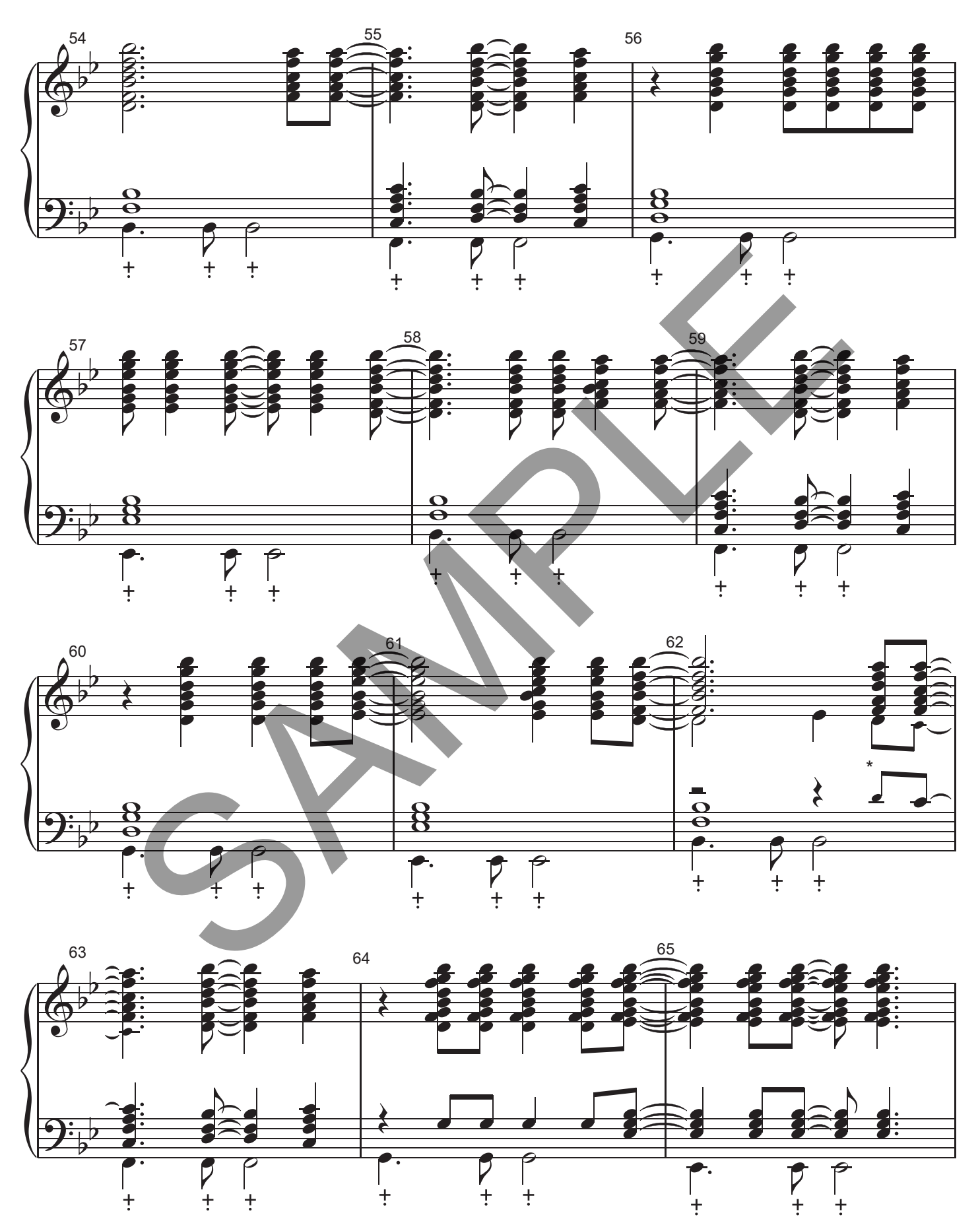
*D5 and C5 are notated in both clefs for rhythmic clarity.